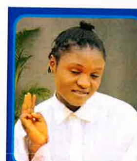
GIFT FRIDAY ISAH