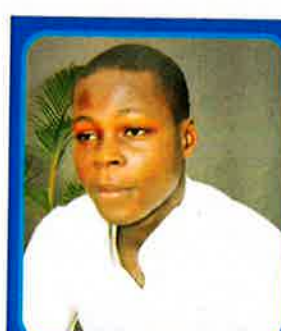
MONDAY BRIGHT TOR Health Prefect Boy's